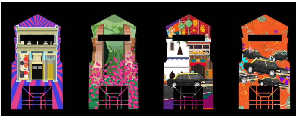
Artists' impression of Madeleine

4 SNF's popular projection mapping installations return with six works illuminating iconic buildings in the city. Rediscover Singapore's mythical origins at the National Museum of Singapore with Stories from Forbidden Hill by Maxin10sity , then head to the National Archives of Singapore for a colourful throwback to the cinema of times past with Midnight Show at the Capitol by MOJOKO , which revisits the classic movie posters that used to adorn the walls of Capitol Theatre and Cathay Picture House.