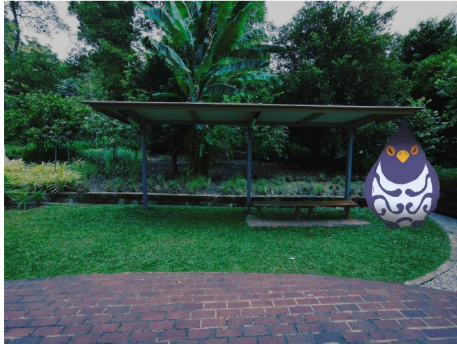
Artist's impression of tobyato bird pitstop, courtesy of tobyato

impact of technology on our daily lives. City of Books , a large-scale anamorphic pavement mural by Fish Jaafar , sheds light on the decline of print media.