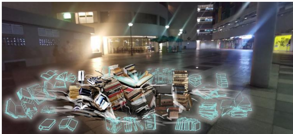
Artist's impression of City of Books, courtesy of Fish Jaafar

6 Night Lights makes its return with 15 installations dotted around the BBB precinct, bringing to life everyday spaces that festival-goers are familiar with in the day but may not have experienced in the beauty of the night. The installations will shine a light on the precinct's rich history and heritage with Night Lights like Paddy Fields by FARM , inspired by rice cultivators along Sungei Brass Brassa; and An Ocean Without The Anchor by Speak Cryptic , that pays homage to the Bugis people and their history as seafarers.