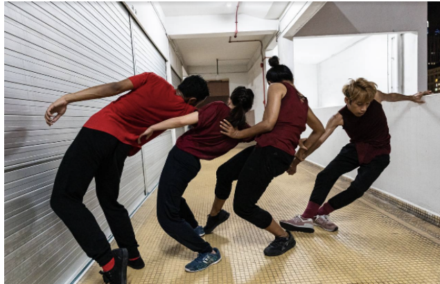
Enactment of Discoloo Centre

9 Festival-goers can also look forward to an exciting line-up of performances at five different locations across both weekends during the festival, which celebrate the diverse and vibrant performing arts scene in the precinct. Yesterday Once More: Queen Street by Inch Chua and Tim De Cotta will dive deep into the history of the precinct, spotlighting personal stories from past and present inhabitants, including a young mother who previously sold noodles along the street come rain or shine; and Auntie Cecilia, who lived through the Japanese Occupation on Queen Street and still resides there today. Armenian Street Party will feature a special catwalk stage at Armenian Street with BBB's very own artists and arts groups taking the limelight, including Bhaskar's Arts Academy, The A Cappella Society, Traditional Arts Centre Ltd, OM The Arts Centre, and SMU Voix. At Waterloo Centre, P7:1SMA's roving act Discoloo Centre will relive the precinct's past nightlife paired with historical anecdotes of disco fever. Music-lovers can also swing over to Jazz'in @ Capitol Singapore at Capitol Singapore's Outdoor Plaza for smooth jazz tunes from home-grown artists such as Amanda Lee Swingtet and The Rhythmakers .