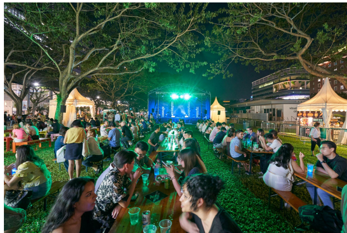
Festival-goers can look forward to food and beverage offerings at the Festival Village by partners including Alley, Praffles, The Swag Social, Sofnade, Pop's Cafe, Tasty Chics, Wado, Vadai Queen and W Noodle.

Dhoby Ghaut Green transforms into an enchanting neon forest as the location of this year's Festival Village with a spectacular line-up of live performances, DJ acts and game stations.