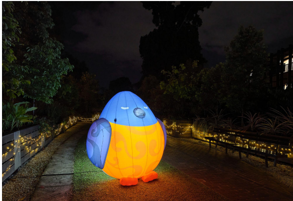
A collection of larger-than-life inflatable artworks by tobyato in Fort Canning Park features birds taking pit stops to rest on their own migratory journeys.