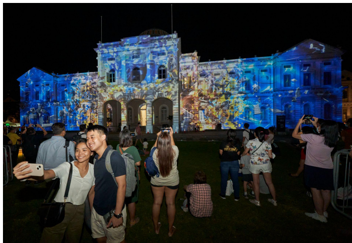
The iconic museum lights up as the wall carvings, royal bath and legend of Badang tell the story of Singapore's mythical origins and history through a mix of sound, light and scenography.

Hungarian projection mapping studio Maxin10sity transforms the façade of the National Museum of Singapore with Stories from Forbidden Hill , an amalgamation of ancient wall murals, nature and treasures that retrace the roots of Fort Canning Park.