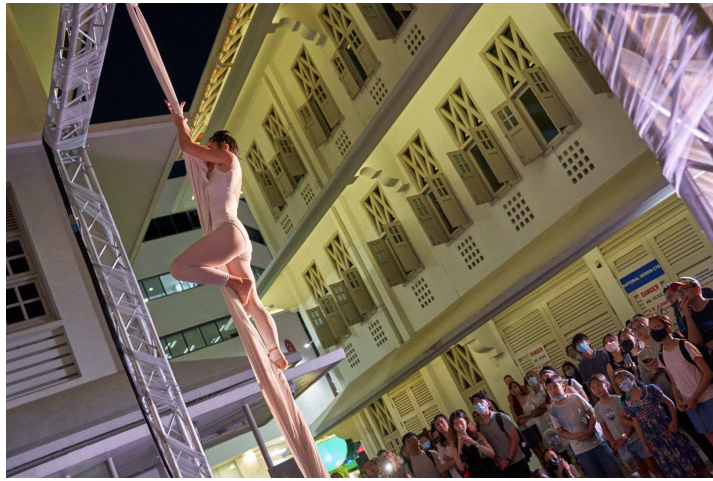
Festival-goers embark on a journey to discover the stories of Queen Street, with a performance by Euphoria Pole & Aerial Studio

Hungarian projection mapping studio Maxin10sity transforms the façade of the National Museum of Singapore with Stories from Forbidden Hill , an amalgamation of ancient wall murals, nature and treasures that retrace the roots of Fort Canning Park.