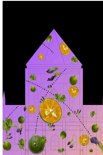
Roadside beauties and healing remedies , courtesy of Adeline Kueh