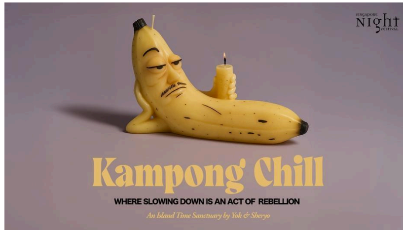
Kampong Chill , courtesy of Yok & Sheryo

7 On the other side of the precinct, discover a calm oasis in the heart of the bustling city with Kampong Chill by artist duo Yok & Sheryo . Nestled at Capitol Singapore, this experience creates a charming pavilion optimised for relaxation. Festival-goers are invited to unwind with unique workshops that capture the essence of island life in Singapore.