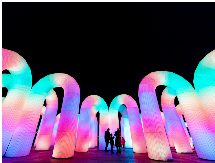
Sky Castle

6 This year, festival-goers are in for a treat with not one, but two highlight experiences that reimagine familiar spaces in the precinct. Cathay Green will be adorned with larger-than-life inflatable arches that respond to the movement of the crowd with a dynamic symphony of colour and sound. Titled Sky Castle , this interactive installation by Australian art and technology studio ENESS evokes the joy that rainbows bring after every storm, carrying a message of hope and renewed beginnings after hardship.